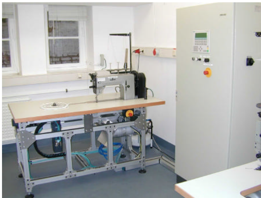
Figure 2: General view of the programmable circular sewing unit